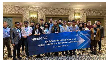
1 st MICAD2020